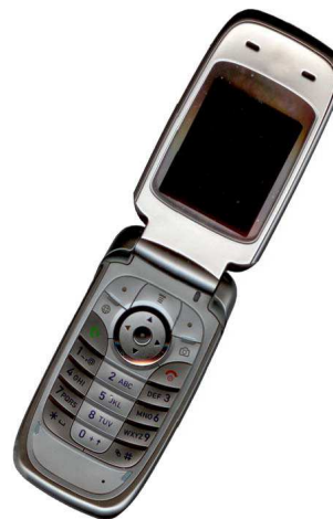
Fig. 3. Example of an image with acceptable resolution