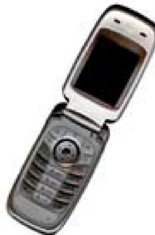
Fig. 2. Example of an unacceptable low-resolution image