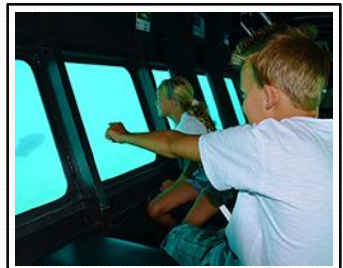
Curaçao Sea Aquarium