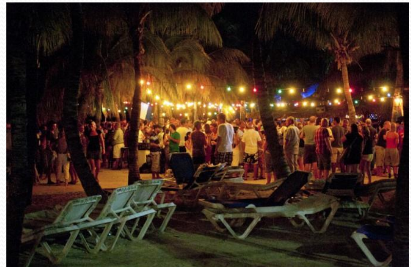
Night party on Seaquarium beach