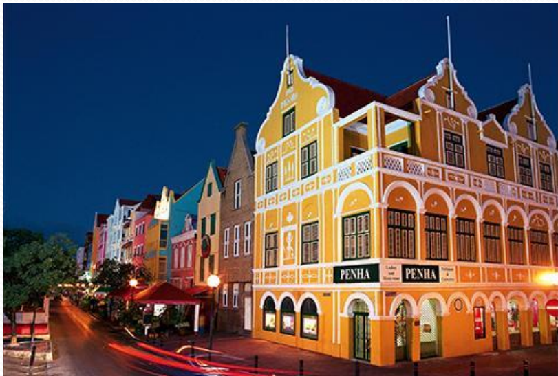
Handelskade street at night