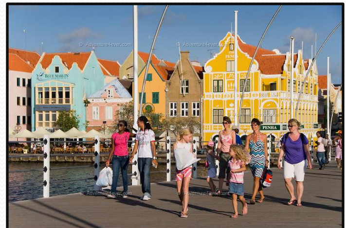
Willemstad colonial architecture (UNESCO World Heritage city)